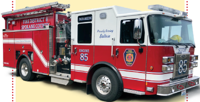
Engine 85: Proudly serving Saltese